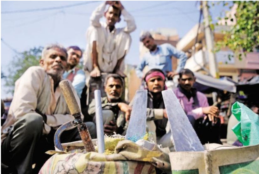
The trend towards the casualization of labour is well established and certain to continue.

In 2014-15, the latest year for which the numbers are available, as much as 93.9% of the addition to the workforce in the formal manufacturing sector was hired through contractors. That means these people weren't directly employed by the manufacturing companies. At a time when the government is talking of the benefits of formalizing the informal sector, what we're seeing is the increasing informalization of the workforce in the organized sector.